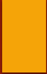
MFD Monthly EMS Responses