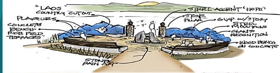
General Vang Pao Memorial