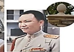
General Vang Pao Portrait in Steel