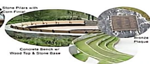
Concrete Bench w/ Wood Top & Stone Base