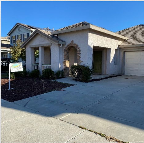
Project Goals Met