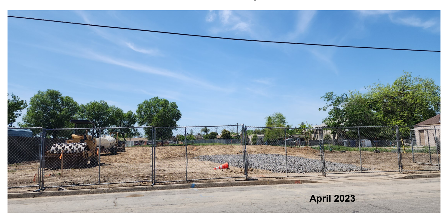
73 South R Street CC915 Merced, Inc.