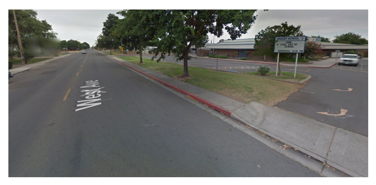
Change the red paint between entry and exit to greed loading and unloading zone/drop off zone