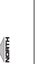
EXISTING SITE PLAN SCALE: 1/4" = 1'-0"

Know what's below. Call before you dig. 1-800-227-2600