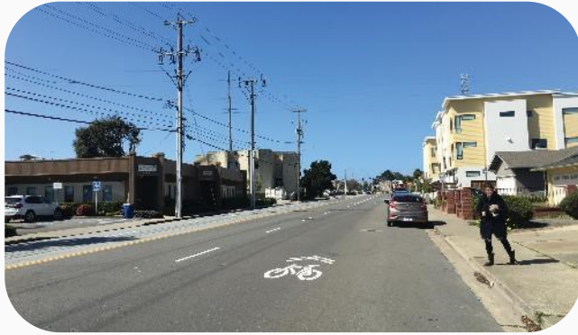
Class III - Bike Route