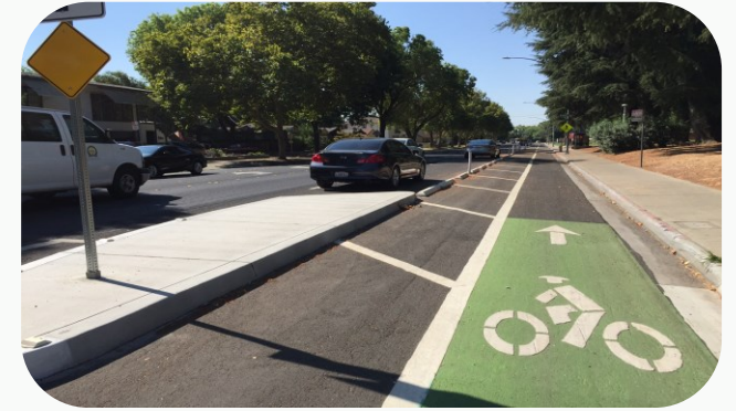
Class IV - Separated Bike Lane