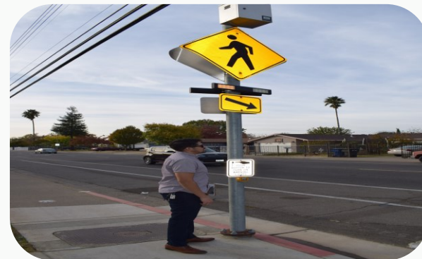
Rectangular Rapid Flashing Beacon