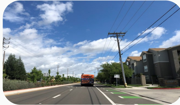
Class IIB -Buffered Bike Lane