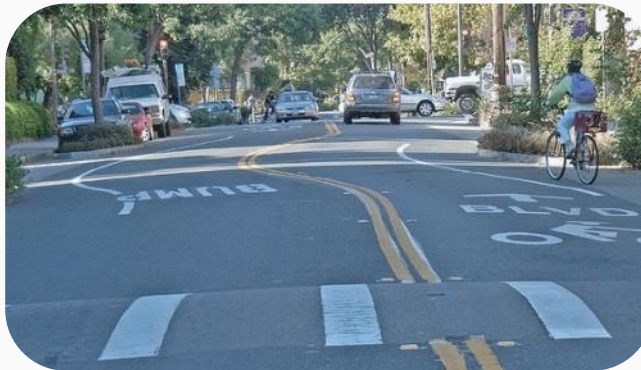
Class IIIB - Bike Boulevard