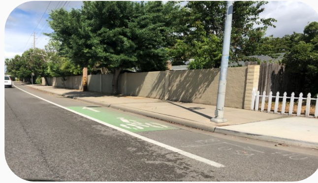
Class II - Bike Lane