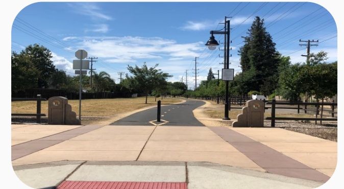
Class I - Shared-Use Path