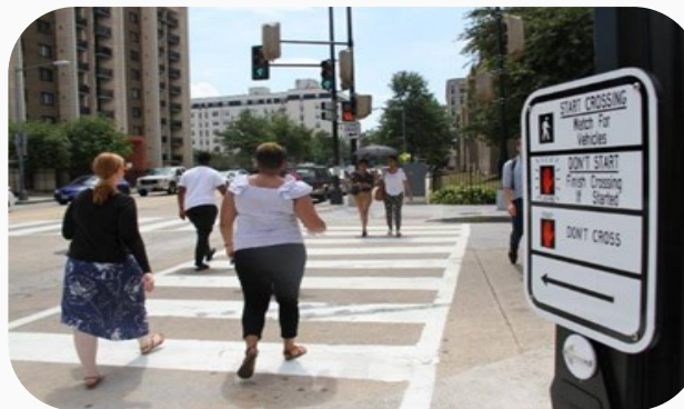
Leading Pedestrian Interval