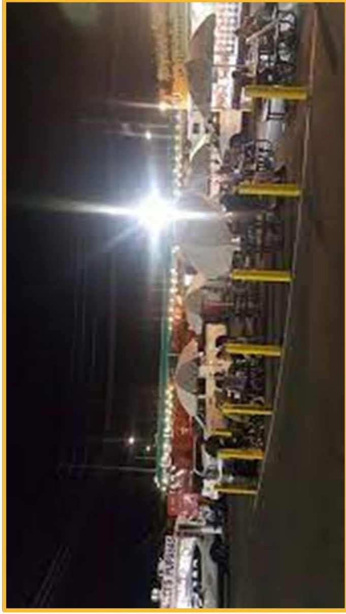
Grub Hub, Modesto CA