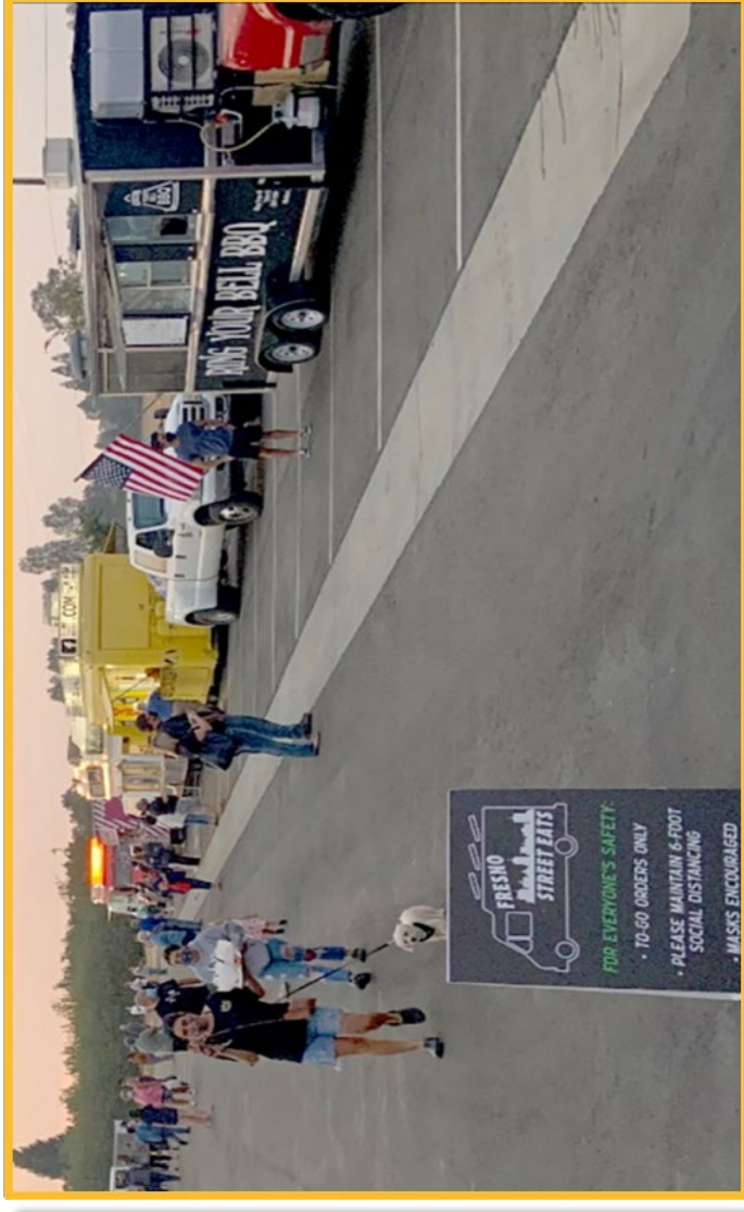
Street Eats, Fresno CA