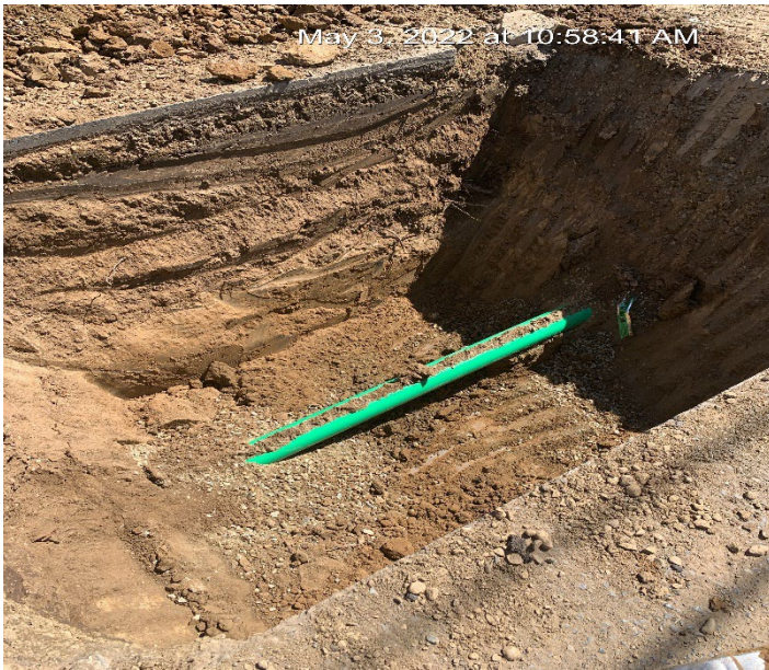
G Street Sewer Main,