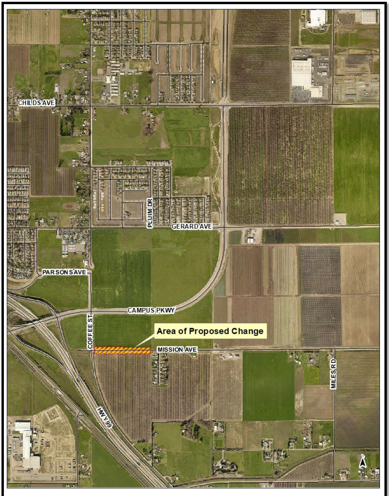
Figure 1 – Location Map