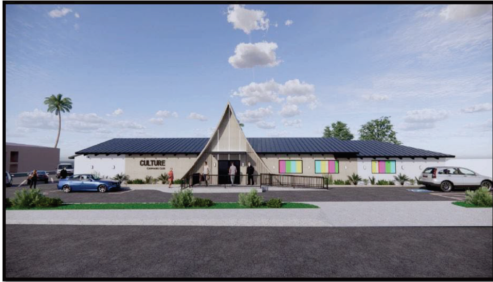
CULTURE PROPOSES REVITALIZING 1111 MOTEL DRIVE. THE ABOVE IS A DESIGN RENDER OF THE EXTERIOR POST-RENOVATION.