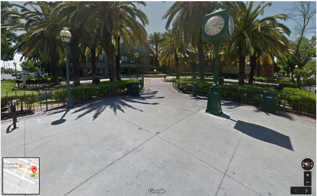
Main Entrance to Event (5-foot wide clear, unobstructed path required) Security Guard Required