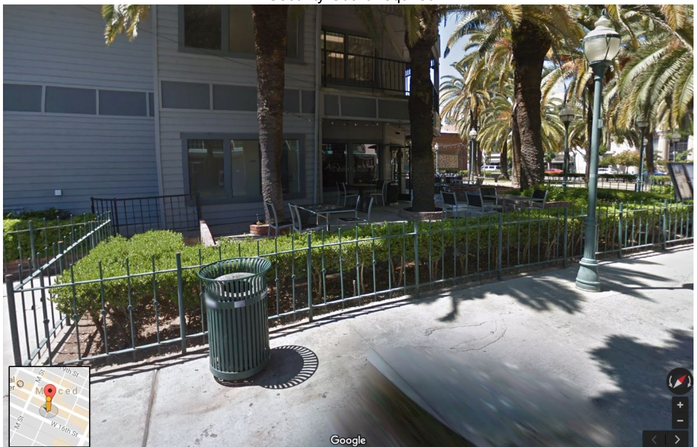
This sidegate of Five Ten Bistro Restaurant shall be staffed by a security guard.