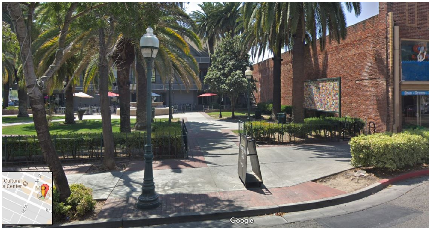
Westernmost Park Entrance - Minimum 5-foot-wide clear unobstructed path required. Security Guard required.