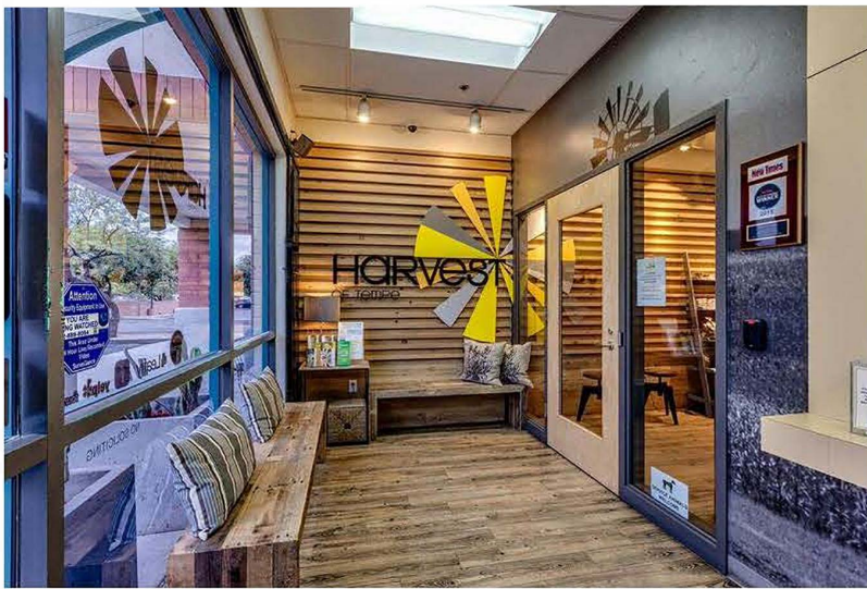
Example of fully constructed Harvest Lobby Area

The lobby will be the sole entrance to the dispensary facility that will be accessible to persons who are not authorized employees of Harvest. In this lobby consumers, visitors, contractors, and members of the Bureau, law enforcement, or other relevant state and local authorities will check-in with the Security Guard on duty before being granted access to any other area of the dispensary facility. Identification for all visitors will be checked to ensure that only qualified individuals are allowed access to the separate, locked retail area where cannabis products are displayed and sold.