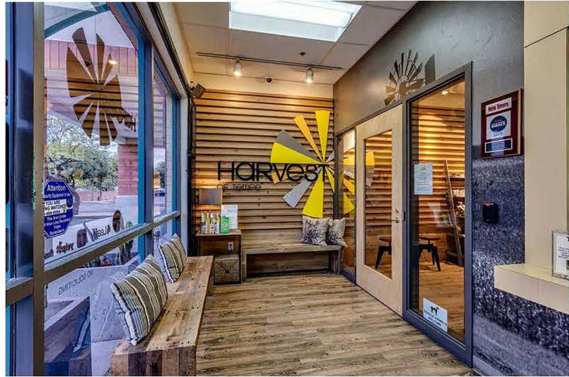
Example of fully constructed Harvest Lobby Area

The lobby will be the sole entrance to the dispensary facility that will be accessible to persons who are not authorized employees of Harvest. In this lobby consumers, visitors, contractors, and members of the Bureau, law enforcement, or other relevant state and local authorities will check-in with the Security Guard on duty before being granted access to any other area of the dispensary facility. Identification for all visitors will be checked to ensure that only qualified individuals are allowed access to the separate, locked retail area where cannabis products are displayed and sold.