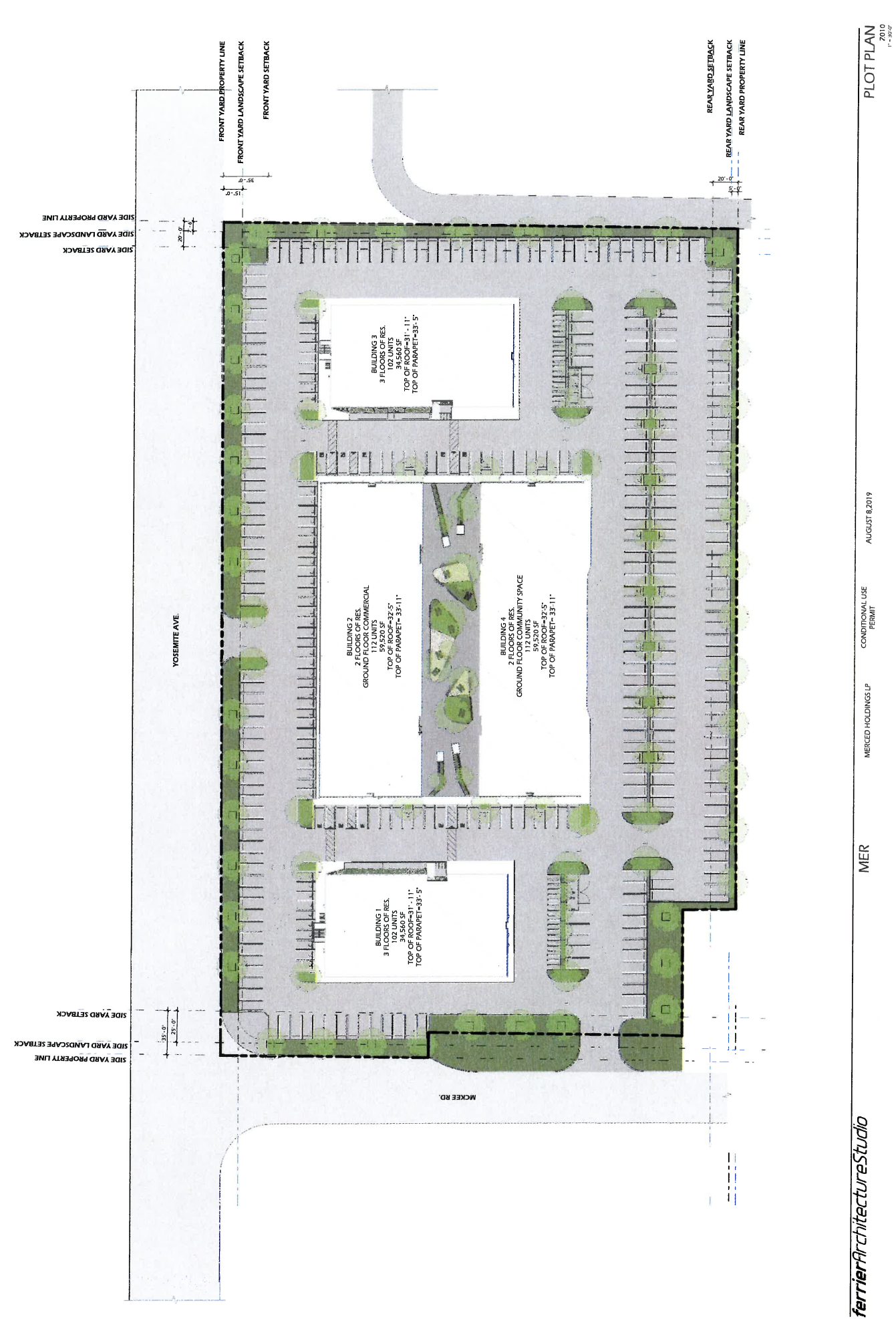
ATTACHMENT 4 - Page1