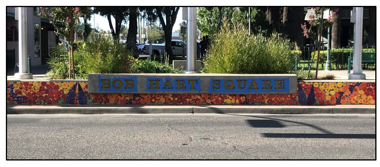
After Photo - Letters Stained & Sealed